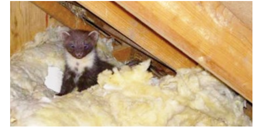
Pine marten kit in roof space

Although the pine marten is one of our more attractive native mammals, they do not make good house guests, for the reasons already discussed.