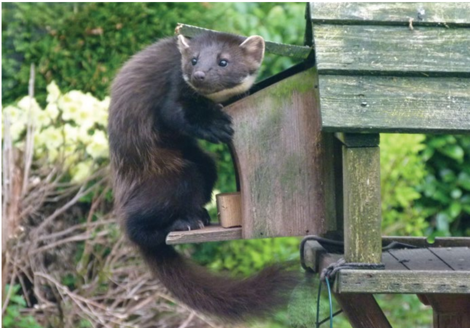
Pine marten on a squirrel feeder

The presence of a female marten and her young in a building can also give rise to problems of smell and hygiene and possibly also structural damage, e.g. when a marten enlarges an existing small gap to gain access to the building. Adult martens do not live in pairs, so if more than one animal is present, it will almost certainly be a female with young. Due to the risk of a female abandoning her kits if disturbed, no action should be taken to exclude or deter a pine marten from a building between the months of March to July. Such action could constitute an offence. If in doubt contact your local NPWS ranger.